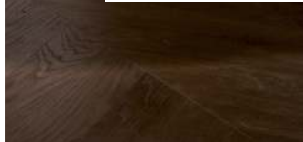
LAZZARO BLUE WALLPAPER £28, ARTHOUSE.COM