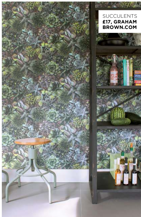
SUCCULENTS £17, GRAHAM BROWN.COM