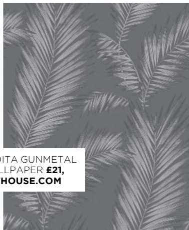
ARDITA GUNMETAL WALLPAPER £21, ARTHOUSE.COM